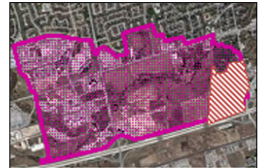
Key Development Area Boundary