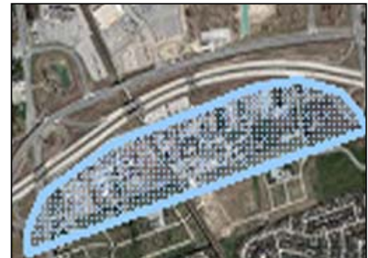
Key Development Area Boundary