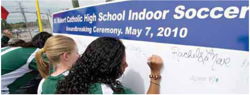
St. Robert students sign autograph board at the opening ceremony for the new soccer field at St. Robert Catholic High School.