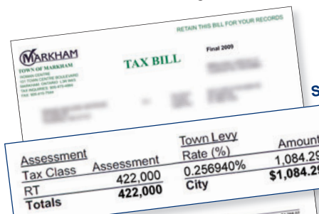
Sample Tax Bill