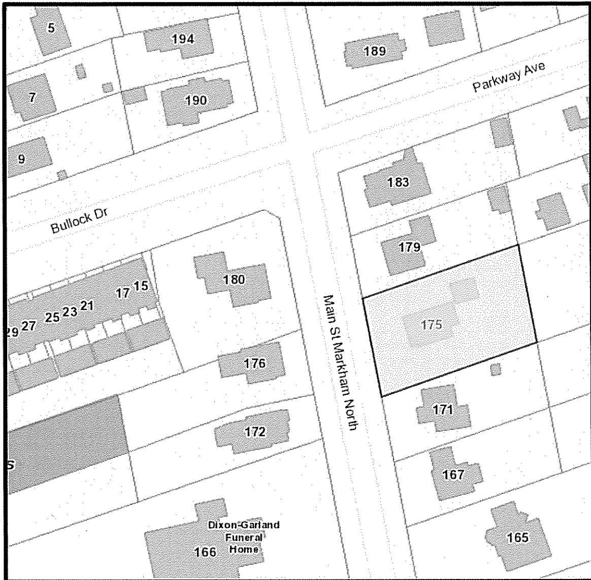
Figure 1 - Location Map