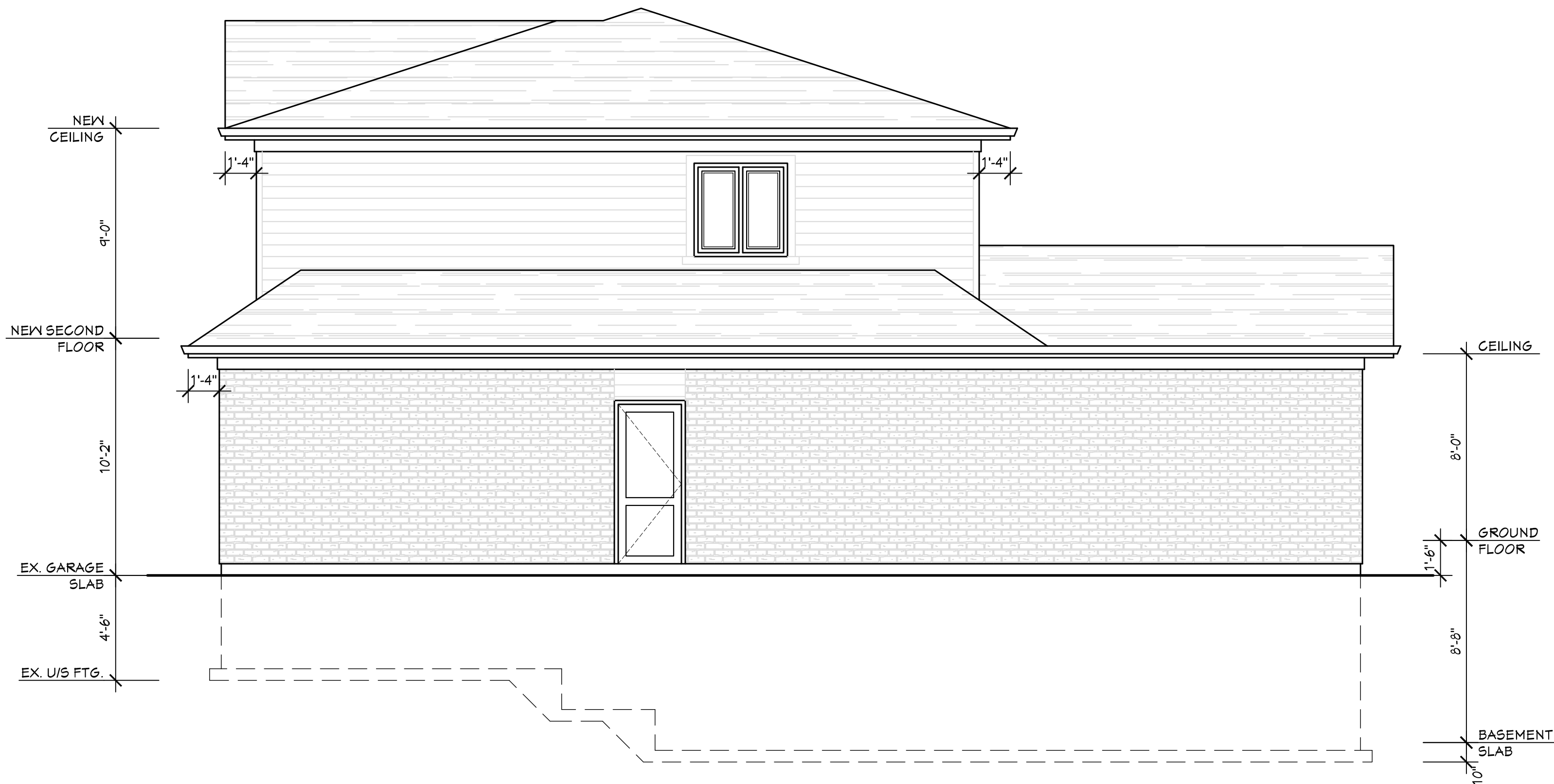
RIGHT (EAST) SIDE ELEVATION