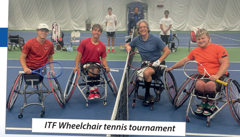
ITF Wheelchair tennis tournament