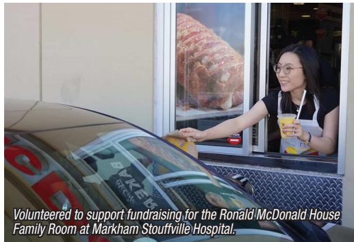
Volunteered to support fundraising for the Ronald McDonald House Family Room at Markham Stouffville Hospital.

The City of Markham has launched Your Voice Markham, a new and unique online platform that allows residents to provide feedback on City matters. By sharing your thoughts and ideas on this platform, you have an opportunity to influence planning and other important City decisions. To be a part of the process, head to yourvoicemarkham.ca and let us know what ideas you have for the future of Markham.