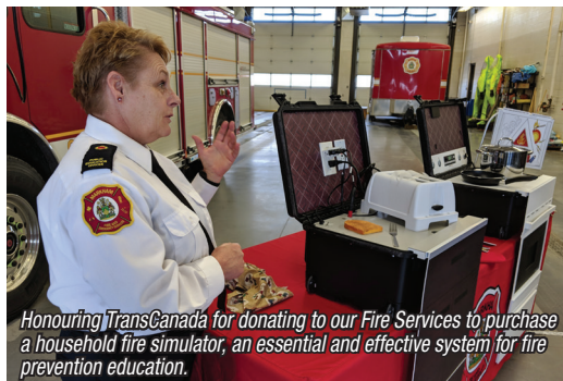
Honouring TransCanada for donating to our Fire Services to purchase a household fire simulator, an essential and effective system for fire prevention education.