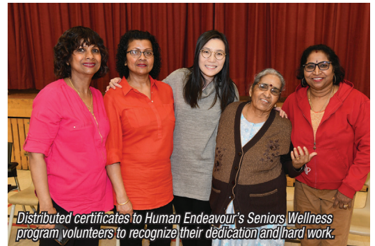
Distributed certificates to Human Endeavour's Seniors Wellness program volunteers to recognize their dedication and hard work.