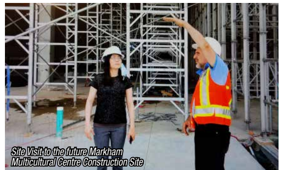
Site Visit to the future Markham Multicultural Centre Construction Site