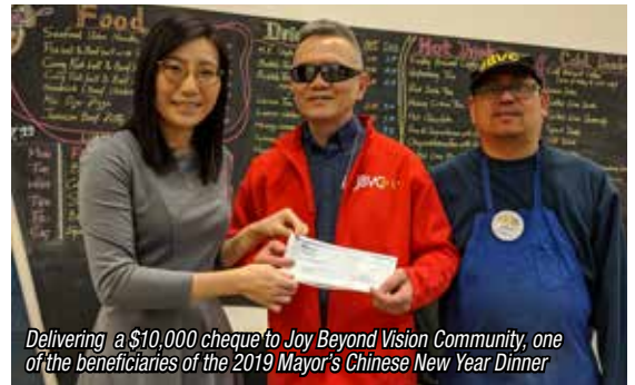
Delivering a $10,000 cheque to Joy Beyond Vision Community, one of the beneficiaries of the 2019 Mayor's Chinese New Year Dinner