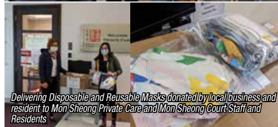
Delivering Disposable and Reusable Masks donated by local business and resident to Mon Sheong Private Care and Mon Sheong Court Staff and Residents