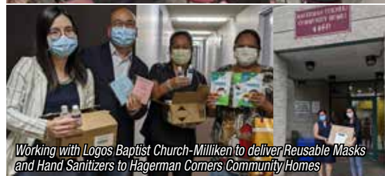
Working with Logos Baptist Church-Milliken to deliver Reusable Masks and Hand Sanitizers to Hagerman Corners Community Homes