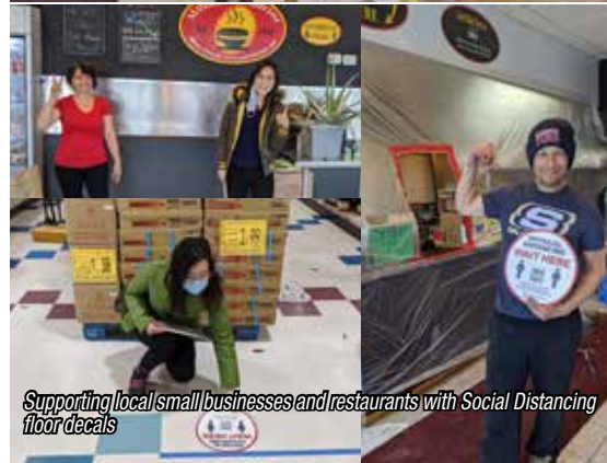
Supporting local small businesses and restaurants with Social Distancing floor decals

Looking for more frequent updates! Subscribe to our digital newsletter