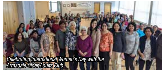
Celebrating International Women's Day with the Armadale Older Adults Club