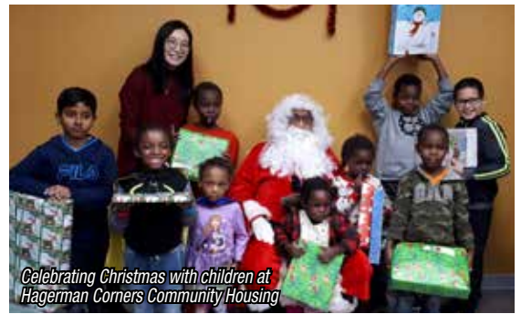
Celebrating Christmas with children at Hagerman Corners Community Housing