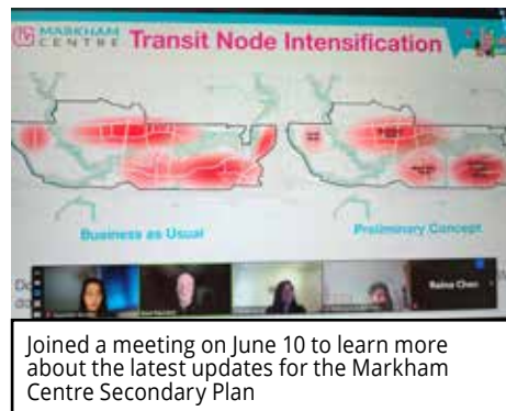
Joined a meeting on June 10 to learn more about the latest updates for the Markham Centre Secondary Plan