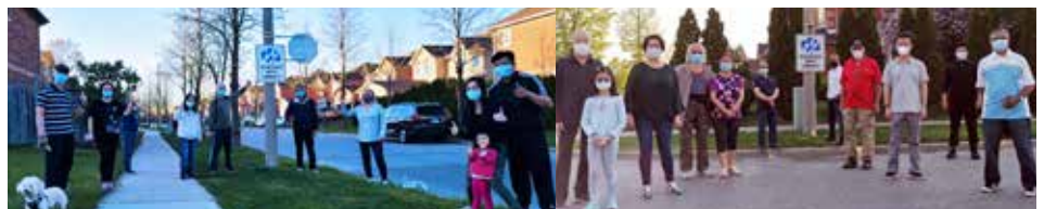
Our newly formed Deib Cres (left) and Kenborough Ct (right) Neighbourhood Watch Groups working together to keep the neighbourhoods safe. Please contact my office if you are interested in joining.