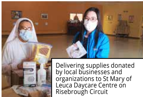
Delivering supplies donated by local businesses and organizations to St Mary of Leuca Daycare Centre on Risebrough Circuit