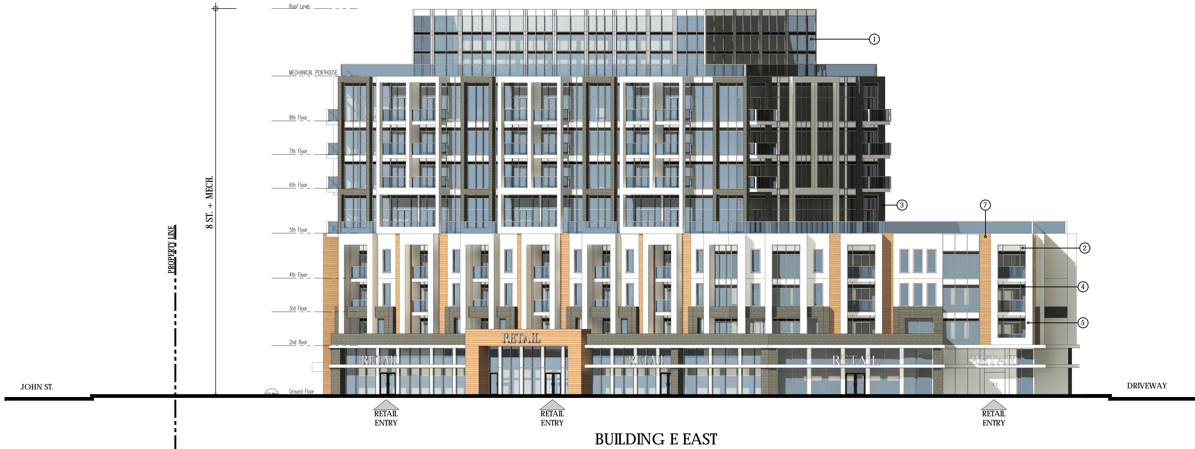
BUILDING E EAST