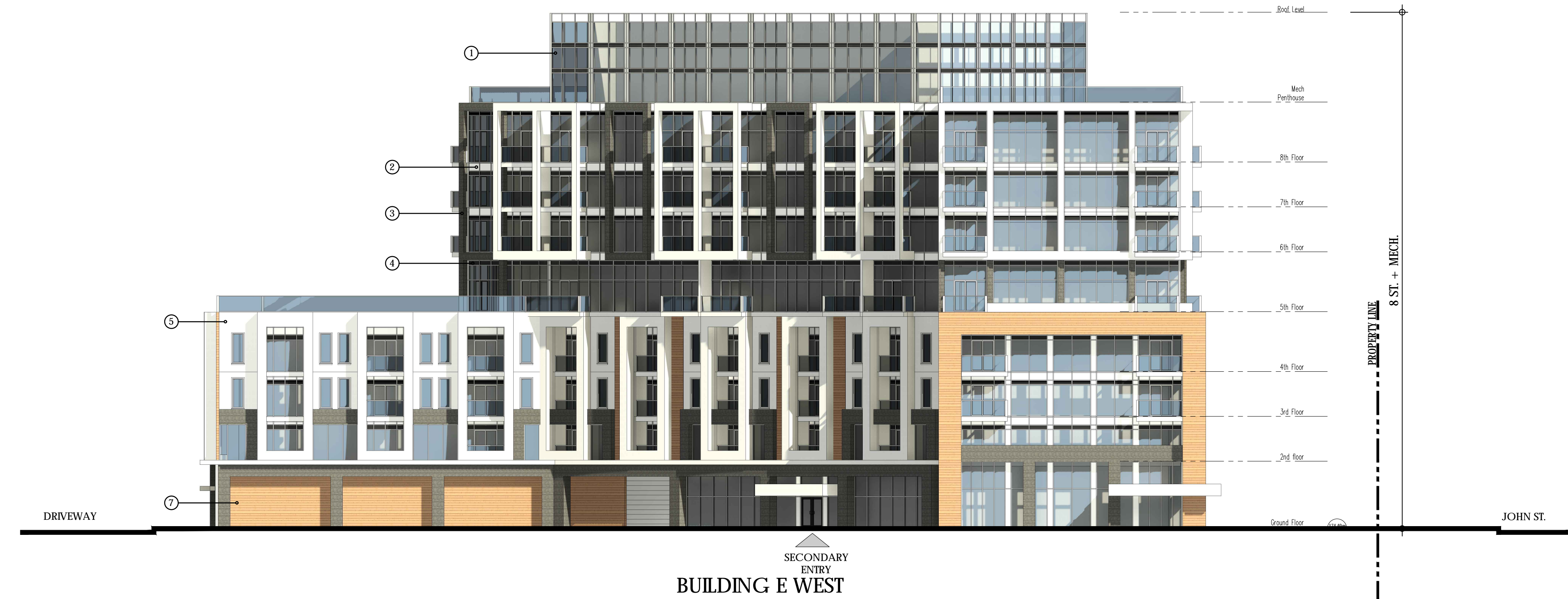
BUILDING E WEST