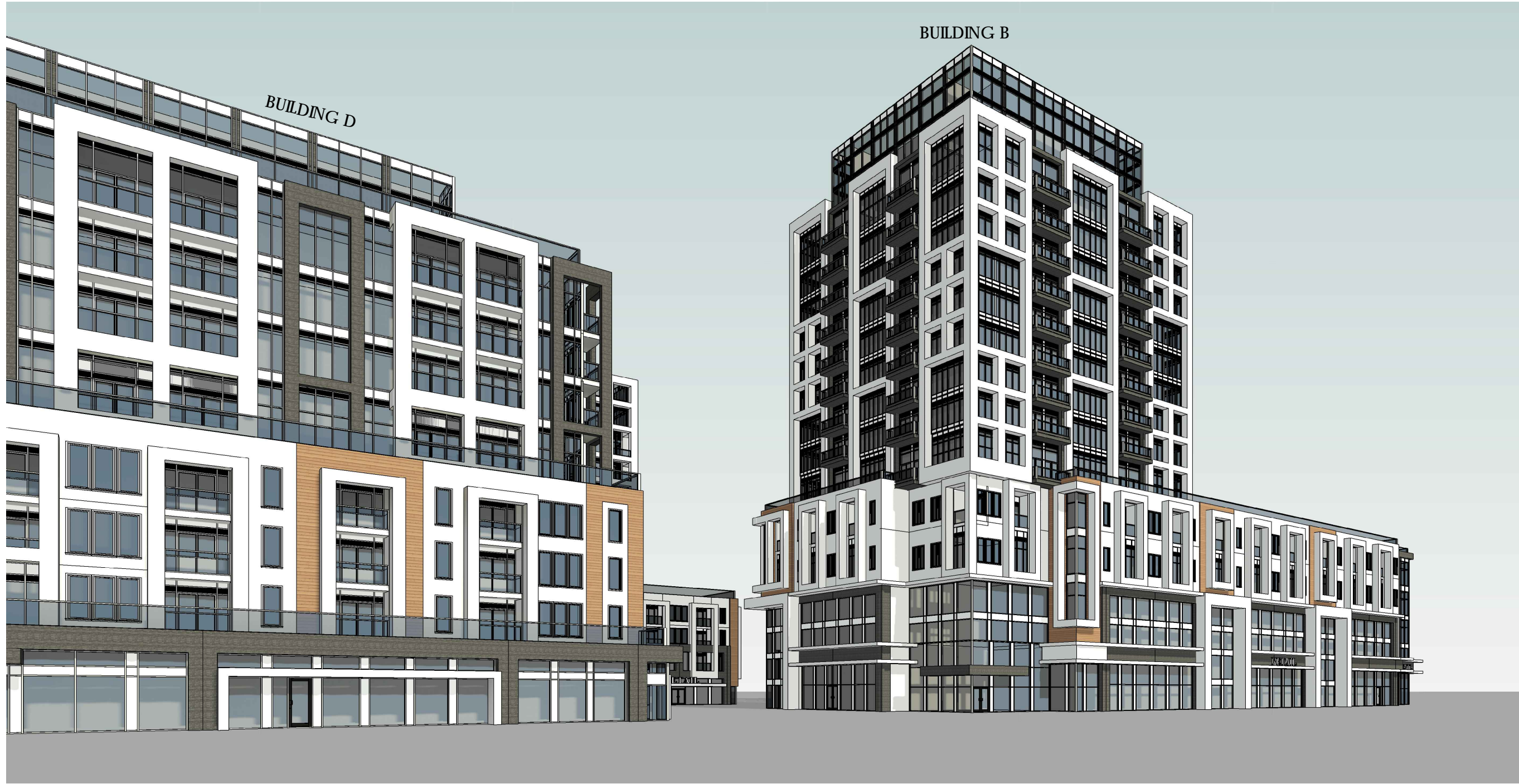
VIEW LOOKING NORTH WEST AT BUILDING A+B

This drawing, as an instrument of service, is provided by and is the property of Graziani + Corazza Architects Inc. The contractor must verify and accept responsibility for all dimensions and conditions on site and must notify Graziani + Corazza Architects Inc. of any variations from the supplied information. Graziani + Corazza Architects Inc. is not responsible for the accuracy of survey, structural, mechanical, electrical, etc., engineering information shown on this drawing. Refer to the appropriate engineering drawings before proceeding with the work. Construction must conform to all applicable codes and requirements of the authorities having jurisdiction. Unless otherwise noted, no investigation has been undertaken or reported on by this office in regards to the environmental condition of this site.