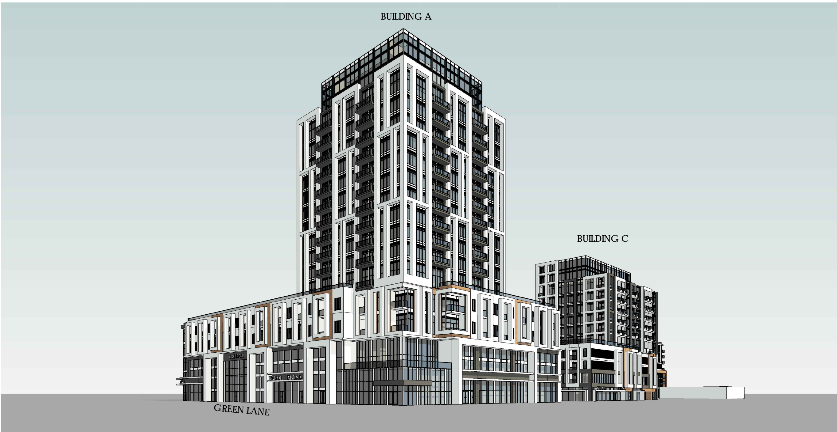
VIEW LOOKING SOUTH EAST AT BUILDING A+B