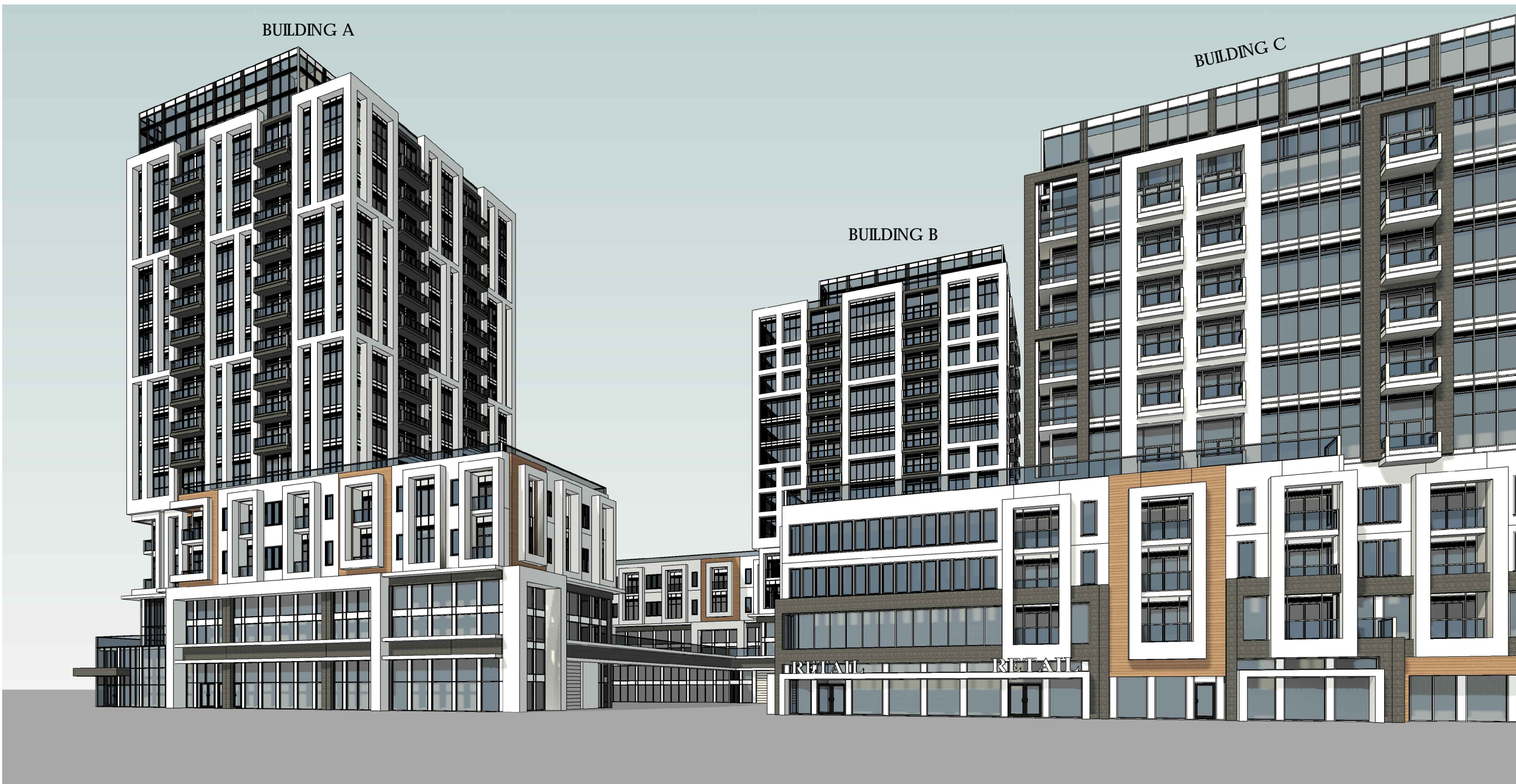
VIEW LOOKING NORTH EAST AT BUILDING A+B