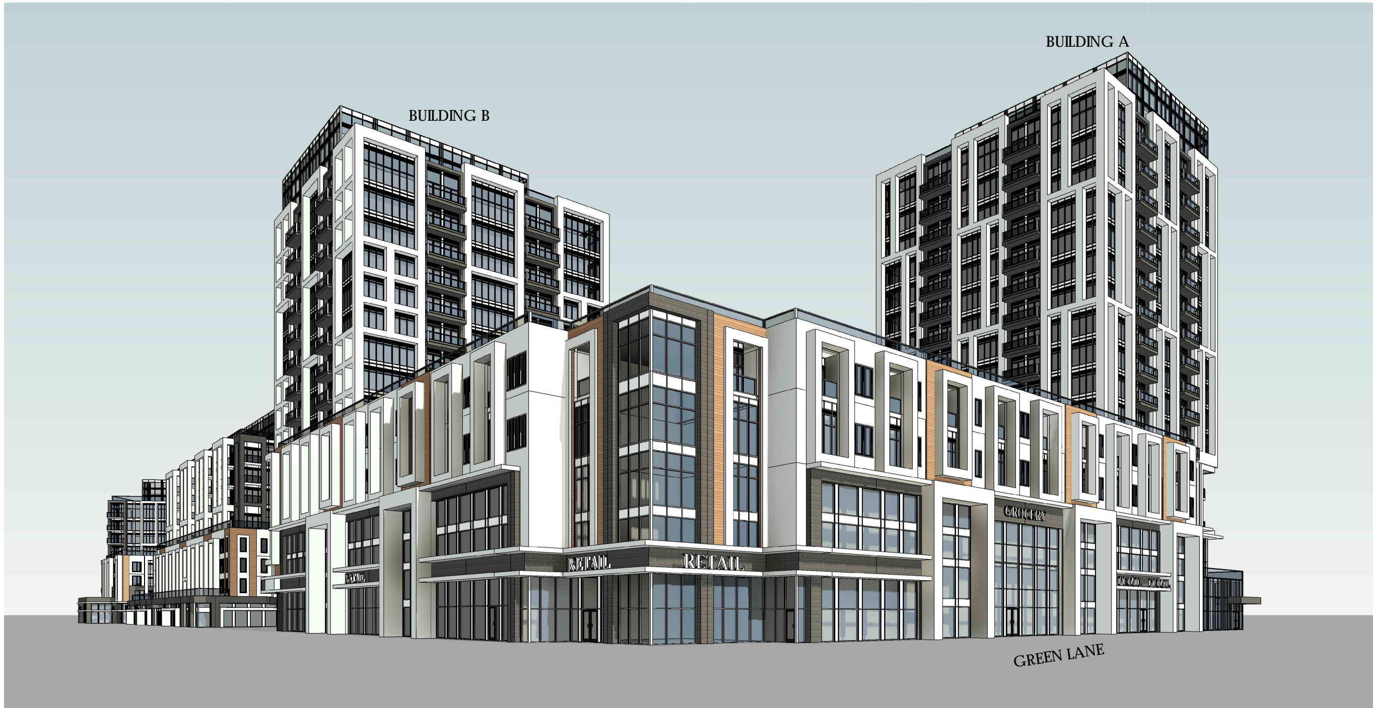
VIEW LOOKING SOUTH WEST AT BUILDING A+B