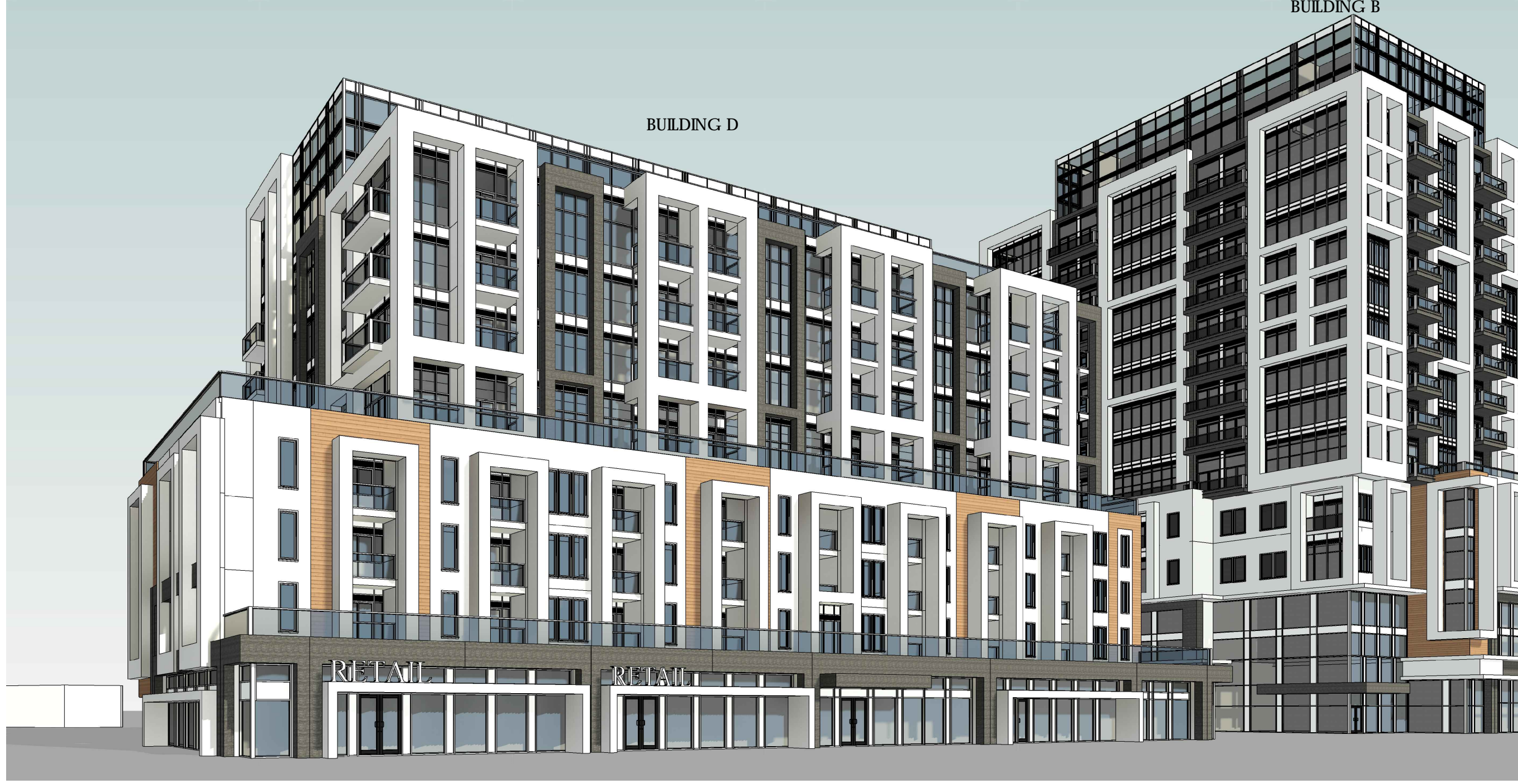
VIEW LOOKING NORTH WEST AT BUILDING D

This drawing, as an instrument of service, is provided by and is the property of Graziani + Corazza Architects Inc. The contractor must verify and accept responsibility for all dimensions and conditions on site and must notify Graziani + Corazza Architects Inc. of any variations from the supplied information. Graziani + Corazza Architects Inc. is not responsible for the accuracy of survey, structural, mechanical, electrical, etc., engineering information shown on this drawing. Refer to the appropriate engineering drawings before proceeding with the work. Construction must conform to all applicable codes and requirements of the authorities having jurisdiction. Unless otherwise noted, no investigation has been undertaken or reported on by this office in regards to the environmental condition of this site.