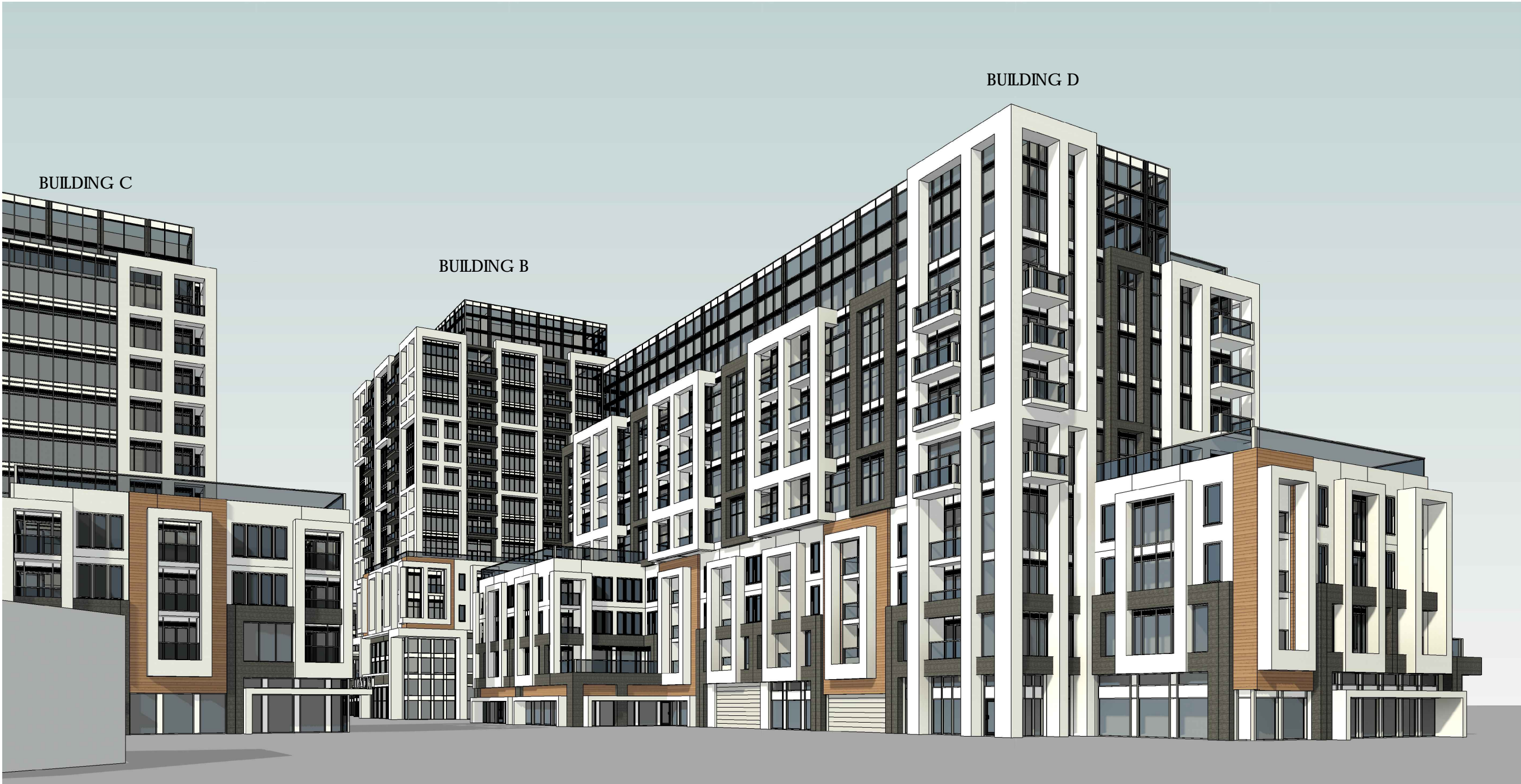
VIEW LOOKING NORTH EAST AT BUILDING D