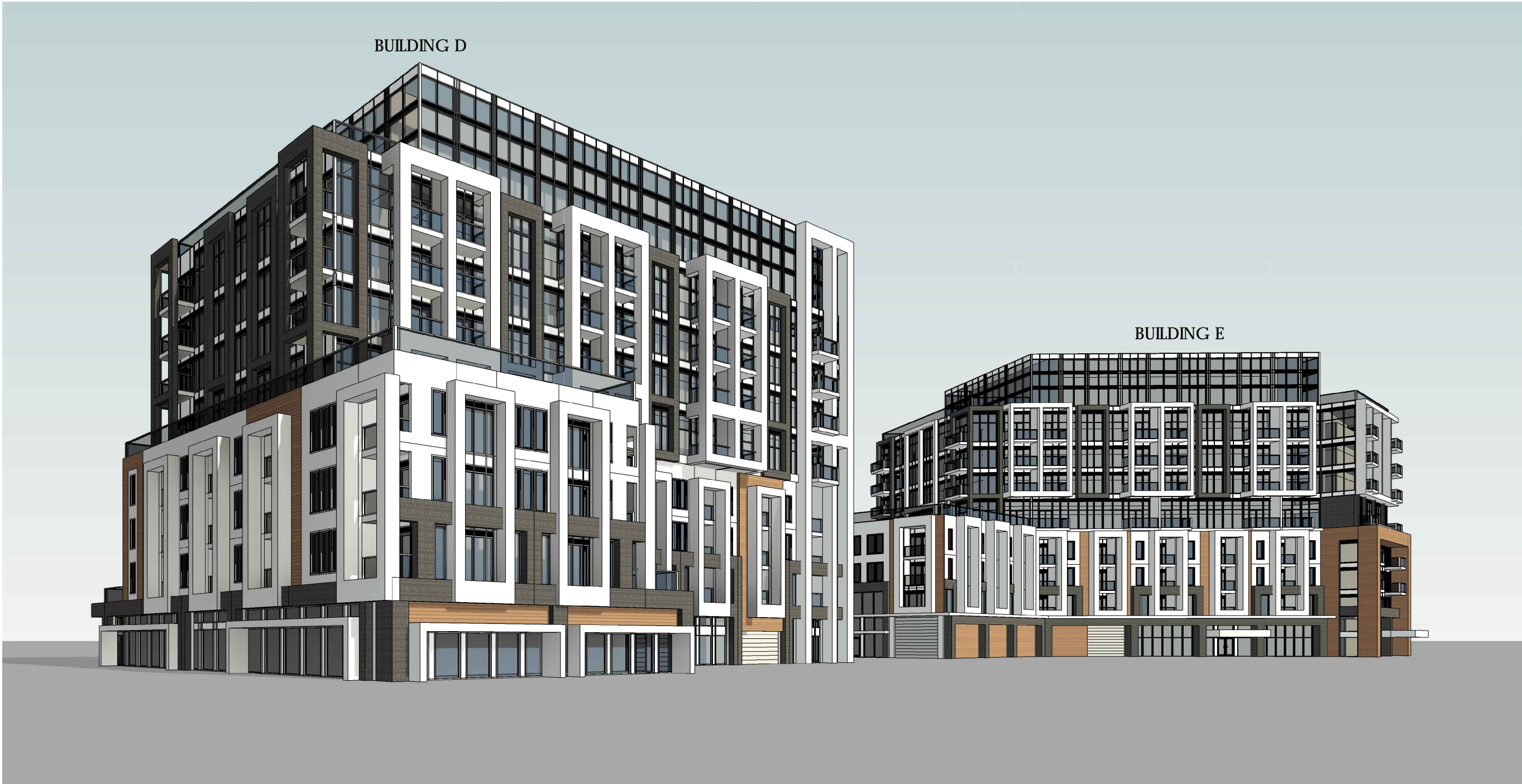
VIEW LOOKING SOUTH EAST AT BUILDING D