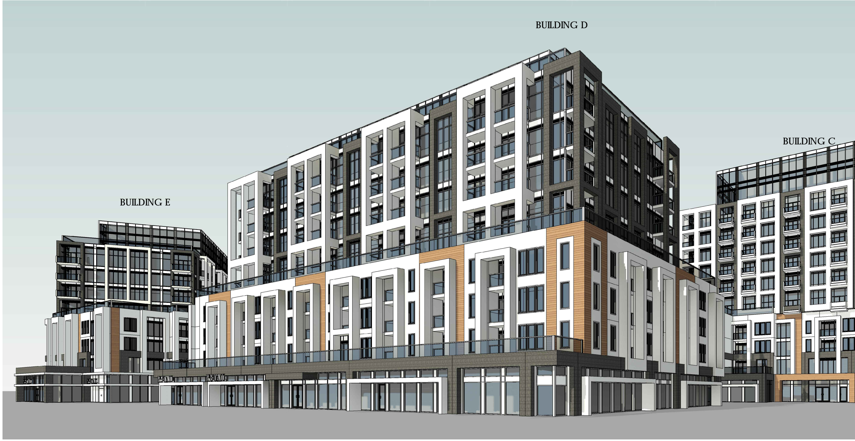
VIEW LOOKING SOUTH WEST AT BUILDING D