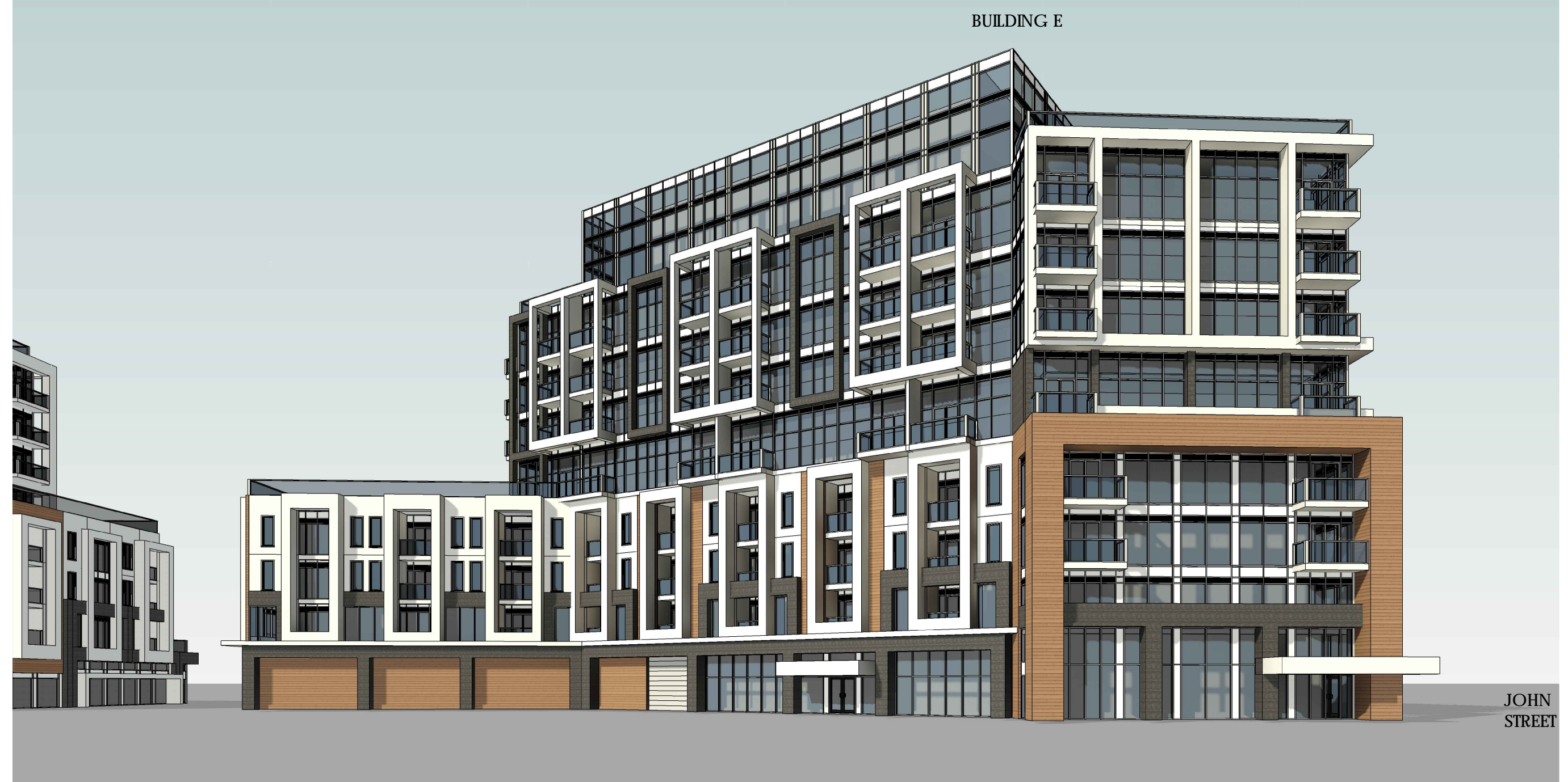
VIEW LOOKING EAST AT BUILDING E