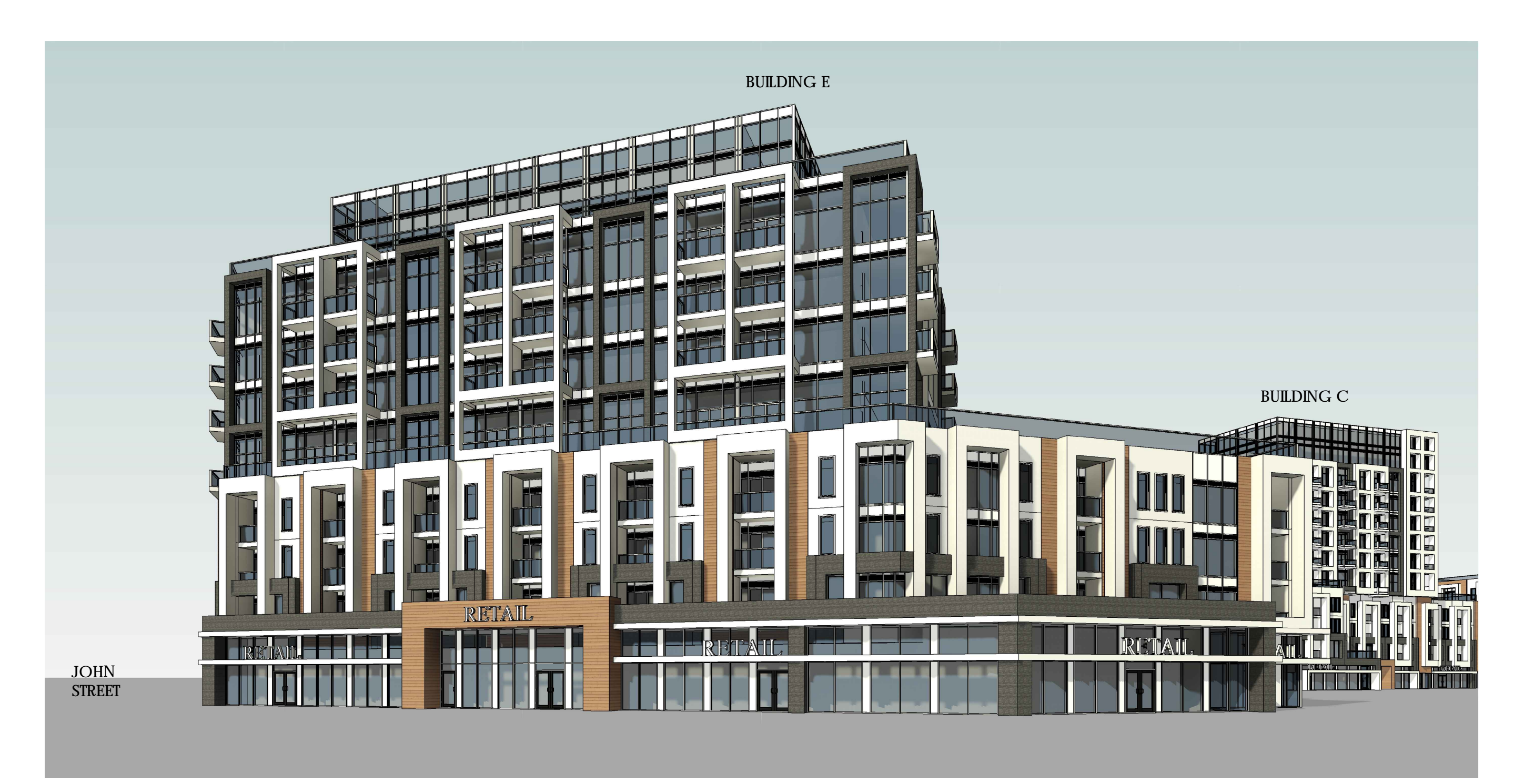
VIEW LOOKING WEST AT BUILDING E