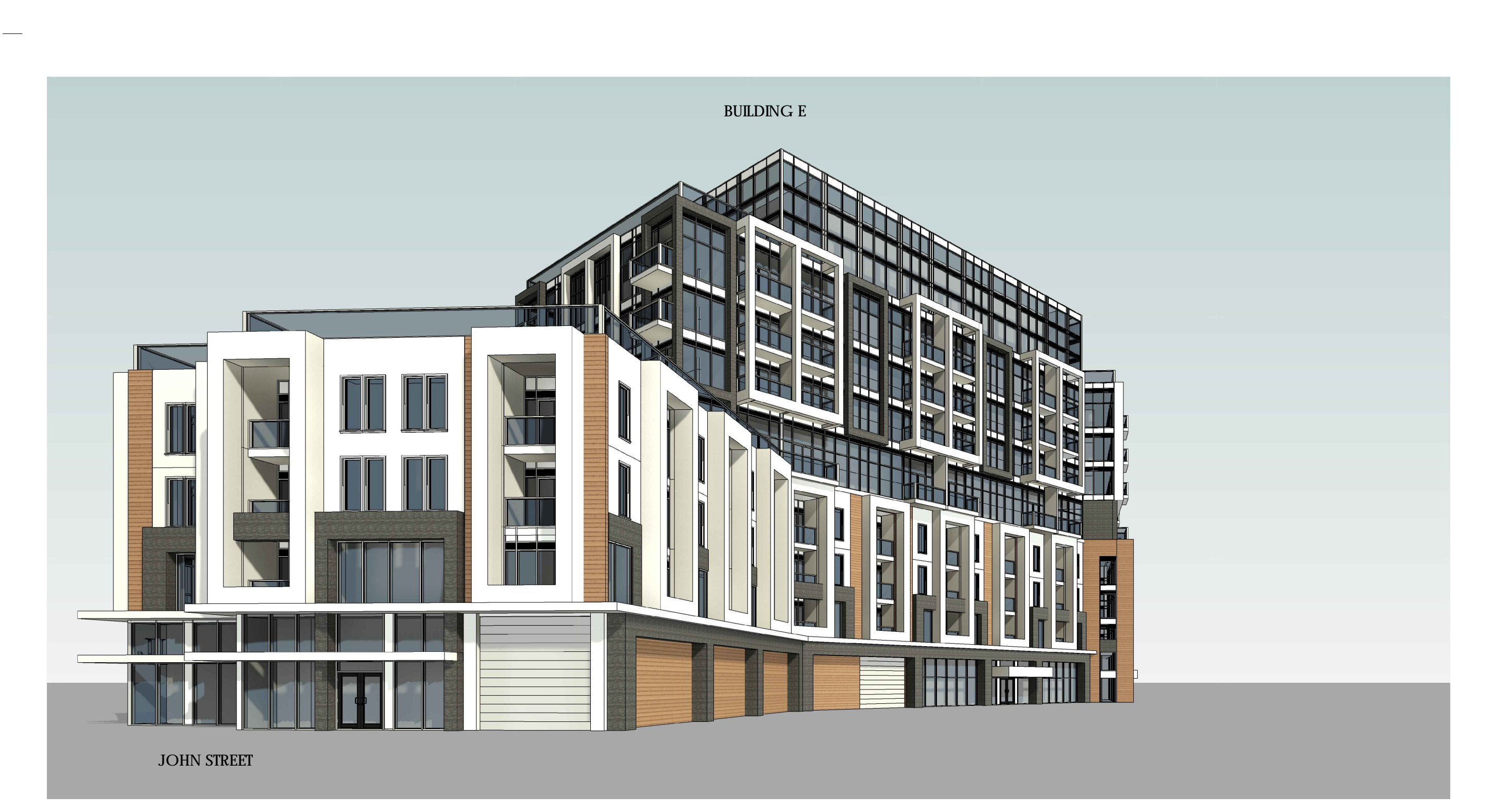
VIEW LOOKING SOUTH EAST AT BUILDING E