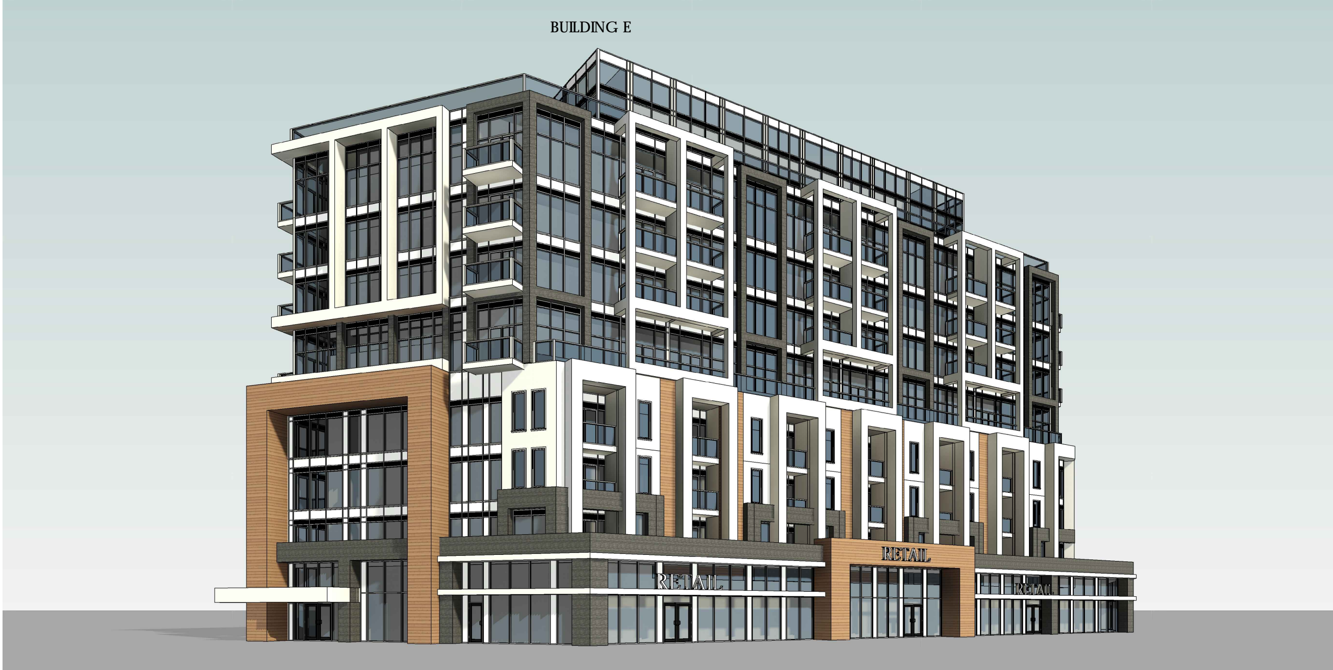
VIEW LOOKING NORTH WEST AT BUILDING E

This drawing, as an instrument of service, is provided by and is the property of Graziani + Corazza Architects Inc. The contractor must verify and accept responsibility for all dimensions and conditions on site and must notify Graziani + Corazza Architects Inc. of any variations from the supplied information. Graziani + Corazza Architects Inc. is not responsible for the accuracy of survey, structural, mechanical, electrical, etc., engineering information shown on this drawing. Refer to the appropriate engineering drawings before proceeding with the work. Construction must conform to all applicable codes and requirements of the authorities having jurisdiction. Unless otherwise noted, no investigation has been undertaken or reported on by this office in regards to the environmental condition of this site.