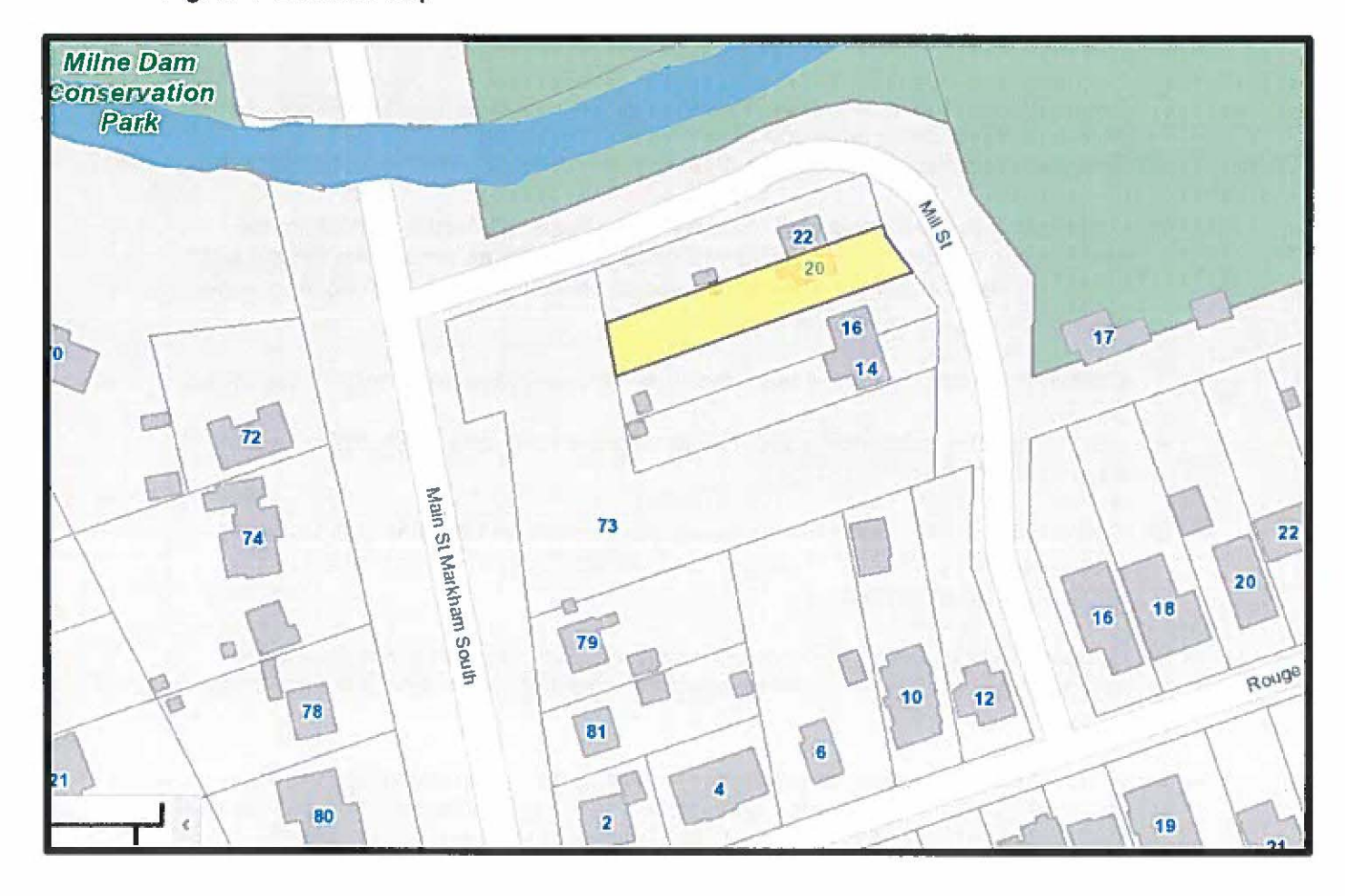
Figure 1- Location Map