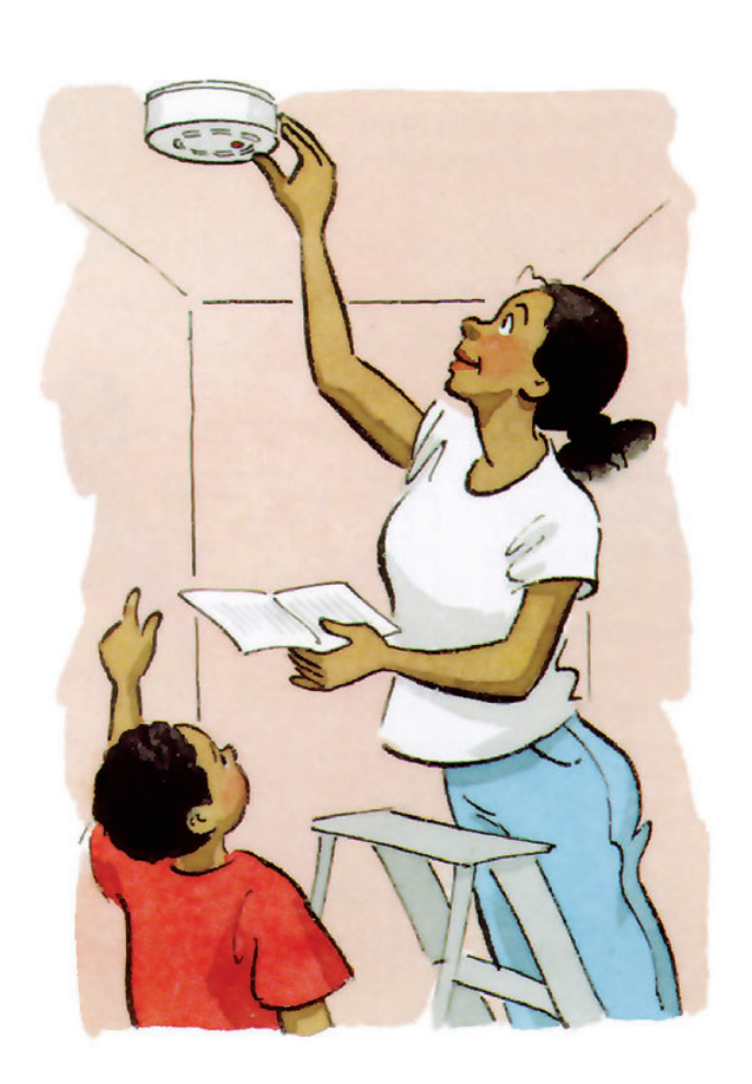
What you need to know